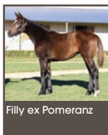
Filly ex Pomeranz