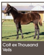
Colt ex Thousand Veils